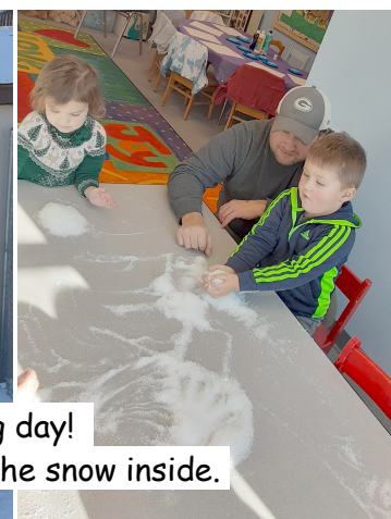
Above: Synod Youth sledding day! Left: Little Lambs bringing the snow inside.