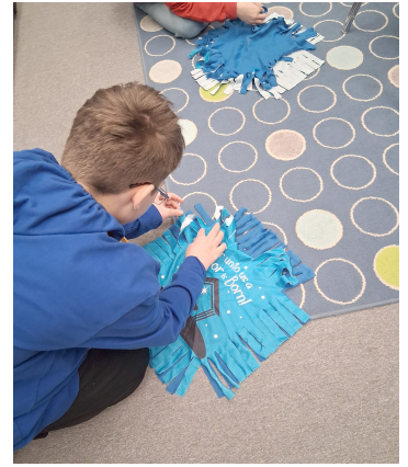
Confirmation students create and deliver a special gift to their families.