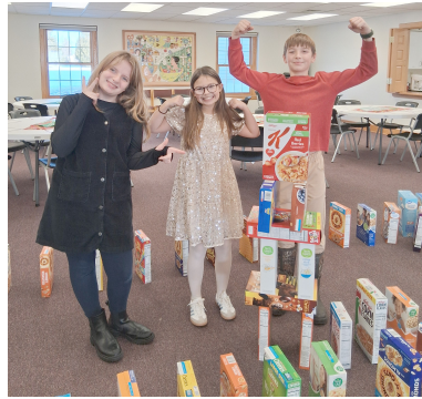
Celebrating breaking a record of over 160 boxes collected in the Great Cereal Box Challenge