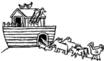
Sunday School News

On January 8th we celebrated coming back to Sunday school by having cake and watching a DVD of the Christmas program. If anyone would like a copy of the DVD, please let me know.